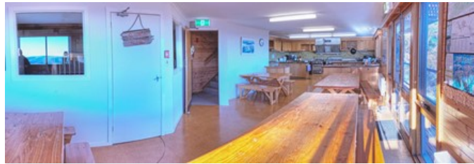
The kitchen & dining area with entrance to "Kids Klub"