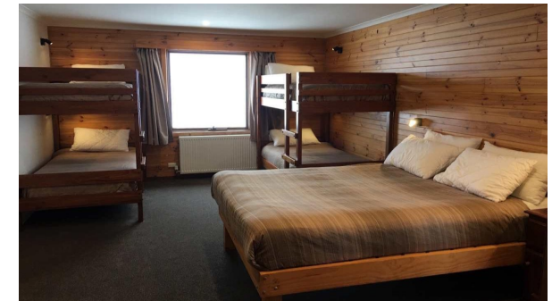
6 bed room