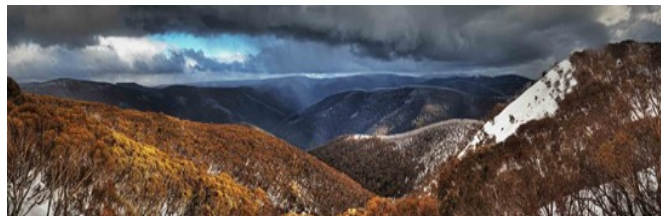
View of the Dargo Valley